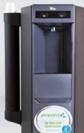
filtered water dispensers