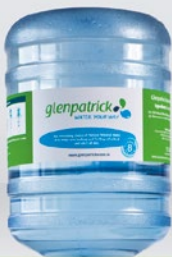
bottled water coolers