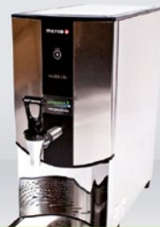
hot water units